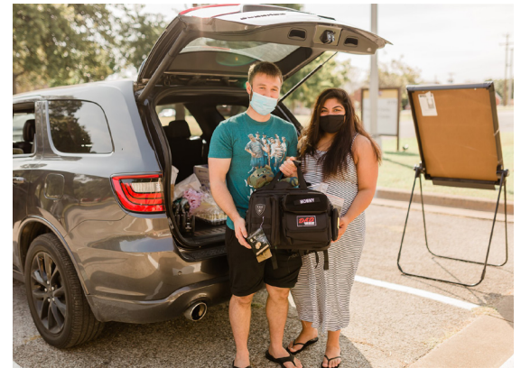
Our military families are growing! In spite of the pandemic, Operation Homefront is able to provide critical baby supplies to new and expecting military moms through our drive-through Star-Spangled Baby showers at locations across the country, like this one in Fort Worth, Texas.

Operation Homefront's highly valued Critical Financial Assistance Program (CFA) has been there to support military families who are facing financial challenges - even in the midst of a crisis. Thanks to the generosity of our corporate, foundation and individual donors, we remain committed to our vital mission to build strong, stable, and secure military families and dedicated to our core belief, to serve our military families in their time of need, because they have done so much for us during our nation's time of need.